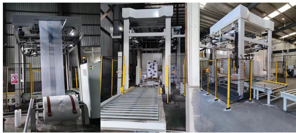
COLD SHRINK PACKING MACHINE IS SUITABLE FOR THE GOODS STACKED ON THE PALLET TO CARRY ON THE BACK CHANNEL TRANSPORTATION PACKAGING, STORAGE PACKAGING.

SMALL FOOTPRINT; LOW CONSUMPTION; LOW ENERGY CONSUMPTION; STRONG ADAPTABILITY