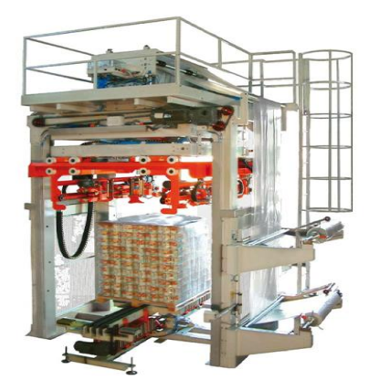
STRAPPING AND WRAPPING INTEGRATED DESIGN DOUBLE MATERIAL PACKAGING