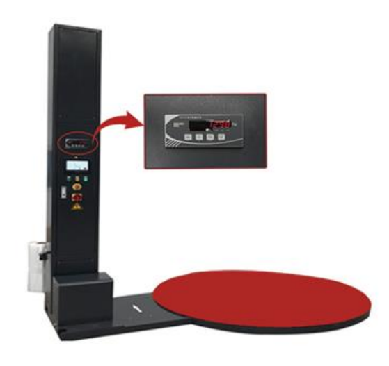
THE WEIGHT OF THE GOODS IS OBVIOUS REDUCE DUPLICATION OF EFFORT RELEVANT DATA CAN BE PRINTED