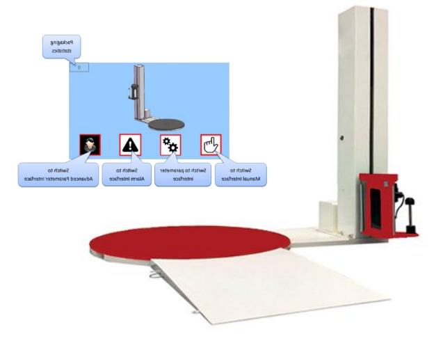
CARRIAGE DESIGN WITH CE SAFETY CERTIFICATION, RAMP MAKES LOADING AND UNLOADING EASIER AND FASTER